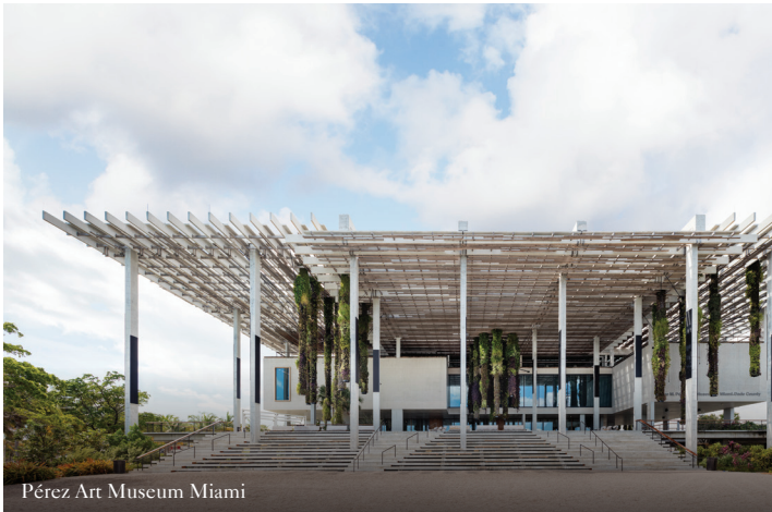
Pérez Art Museum Miami