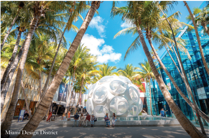
Miami Design District