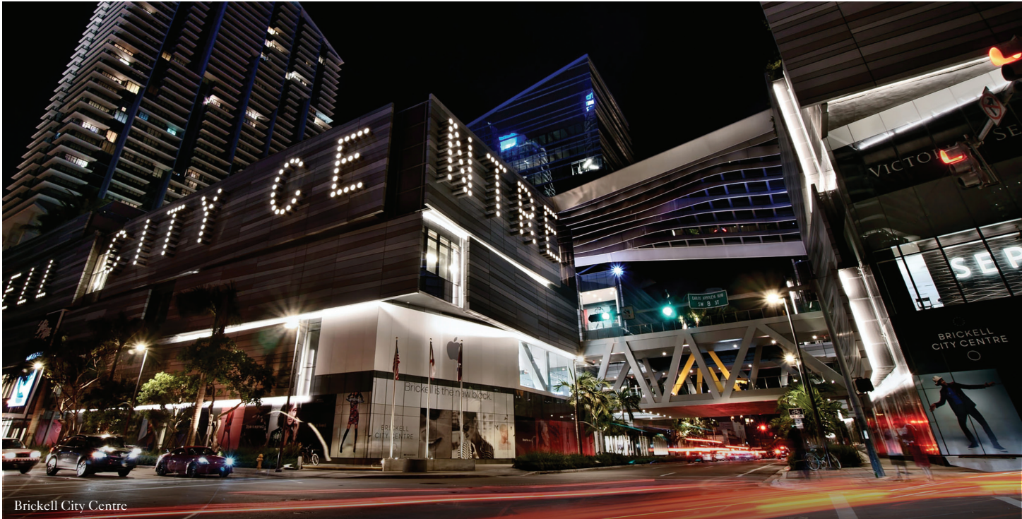
Brickell City Centre

Perfectly positioned at the entrance of Brickell Avenue, where the Miami River meets the beautiful blue waters of Biscayne Bay, and the bustling financial district blends with high-end shopping, top restaurants, cultural hot spots and exiting nightlife — this iconic neighborhood is an all-day all-night lifestyle destination, aptly named the Manhattan of the South.