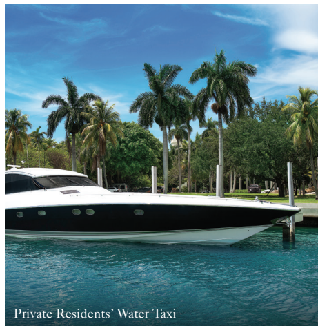
Private Residents' Water Taxi