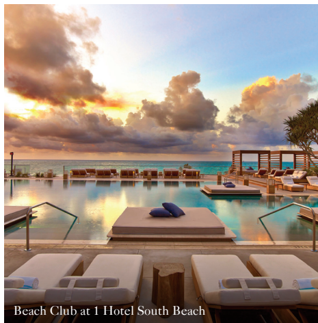
Beach Club at 1 Hotel South Beach

The private marina, planned riverside restaurant and lushly landscaped river promenade invite residents to spend hours and days luxuriating in the infinite energy and organic sparkle of life by the water. Watch the superyachts come and go, take a sunset stroll towards the bay, or head to a number of chic waterside restaurants courtesy of our private water taxi service. Residents can enjoy private membership and exclusive access to the Beach Club at 1 Hotel South Beach, SH Hotels & Resorts sister property. With loungers, beach towel services, cabanas, and seaside snack and beverage services, this waterfront community will cater to leisurely hours under the sun. Take a break from the hustle and bustle of the city and unwind with a cool drink in hand and the sand between your toes.